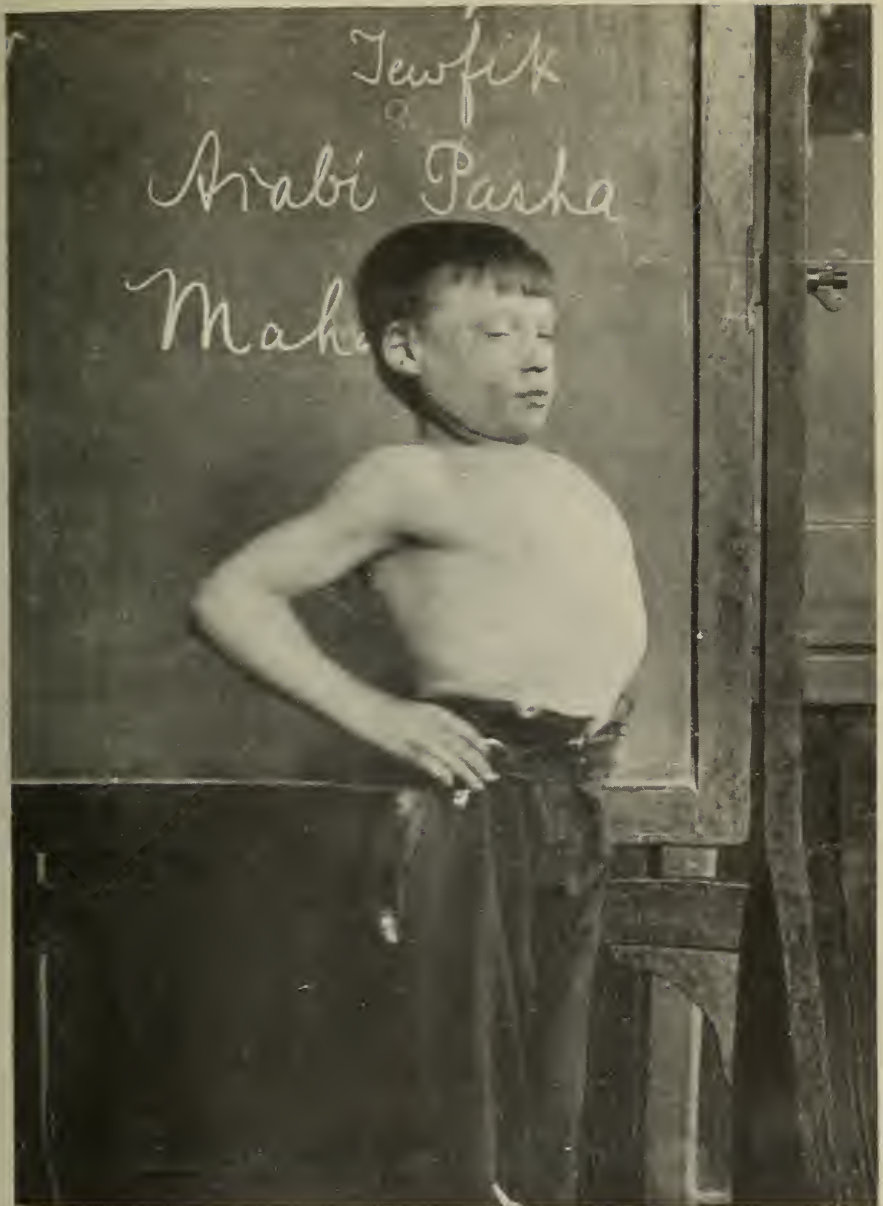
THIS PHOTOGRAPH, PUBLISHED A FEW YEARS AGO IN AN ENGLISH DAILY PAPER, REPRESENTS A MEMBER OF A CLASS IN A LONDON COUNTY COUNCIL SCHOOL PERFORMING DEEP BREATHING EXERCISES. ON THE BACK OF THIS PAGE THIS LAD MAY BE SEEN AT WORK IN THE CLASS. THESE UNFORTUNATE BOYS AS HERE SHOWN ARE SIMPLY BEING DEVELOPED INTO DEFORMITIES. LUCKILY OF LATE A CHANGE FOR THE BETTER HAS TAKEN PLACE IN SCHOOL CALISTHENICS